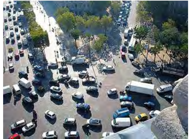
Figure 1 The traffic circle at the Arc de Triomphe, in Paris

The roads are at right angles to the circle. Priority is given to cars entering the circle. Pedestrians have access to the centre.