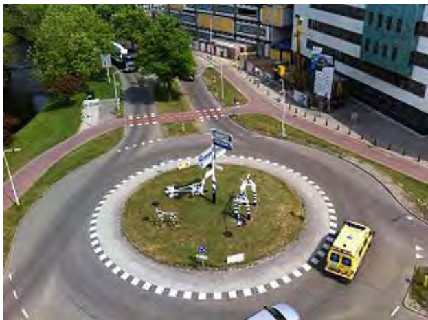
Figure 5 A bike path outside the lanes of a roundabout

These are generally set back one or two car lengths from the entrances into the roundabout. Pedestrians use the same lane.