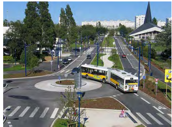
Figure 2 A multi-modal roundabout