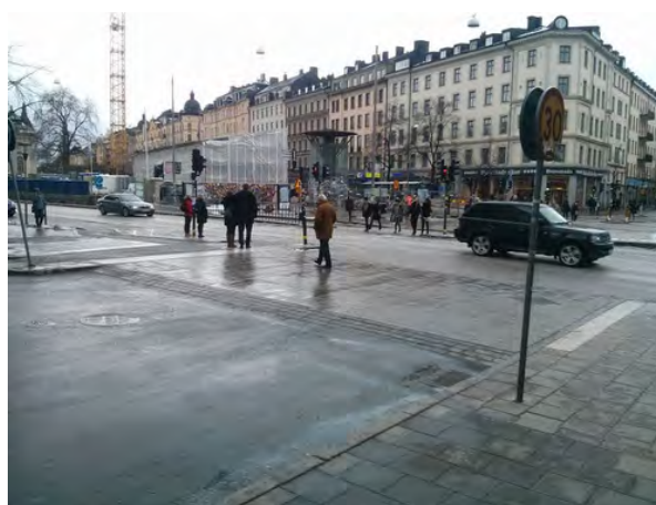
Figure 1 A sidewalk crossing in Stockholm (Sweden)

In any case, aging and its associated issues probably serve to strengthen the justification for and the importance of a number of interventions, standards or principles already promoted by many public health actors. Indeed, densification, increased mixity of land use and the connectivity of public roadway networks, as well as designs that encourage active modes of transportation and enhance their safety (protected bike paths, raised intersections and other protective devices separating active modes of travel from the flow of motorized traffic or slowing down motor vehicles) support the adoption of active modes of travel and improve transportation safety. Such devices are particularly relevant for seniors, as for other categories of persons with reduced agility and ability levels or high levels of insecurity.