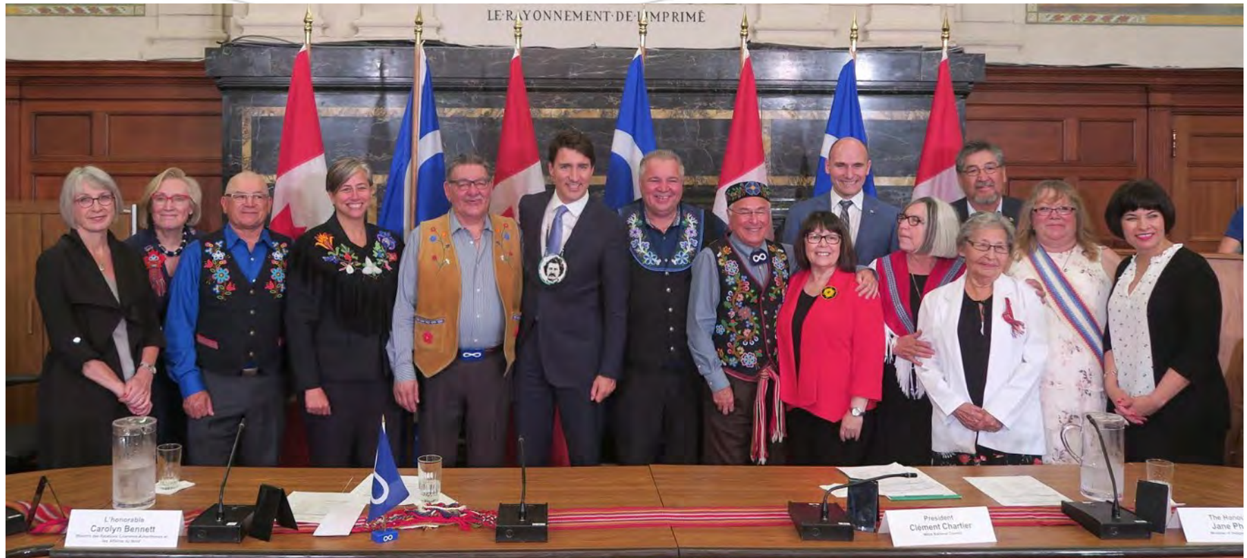
Métis Nation-Crown Summit, June 15, 2018.