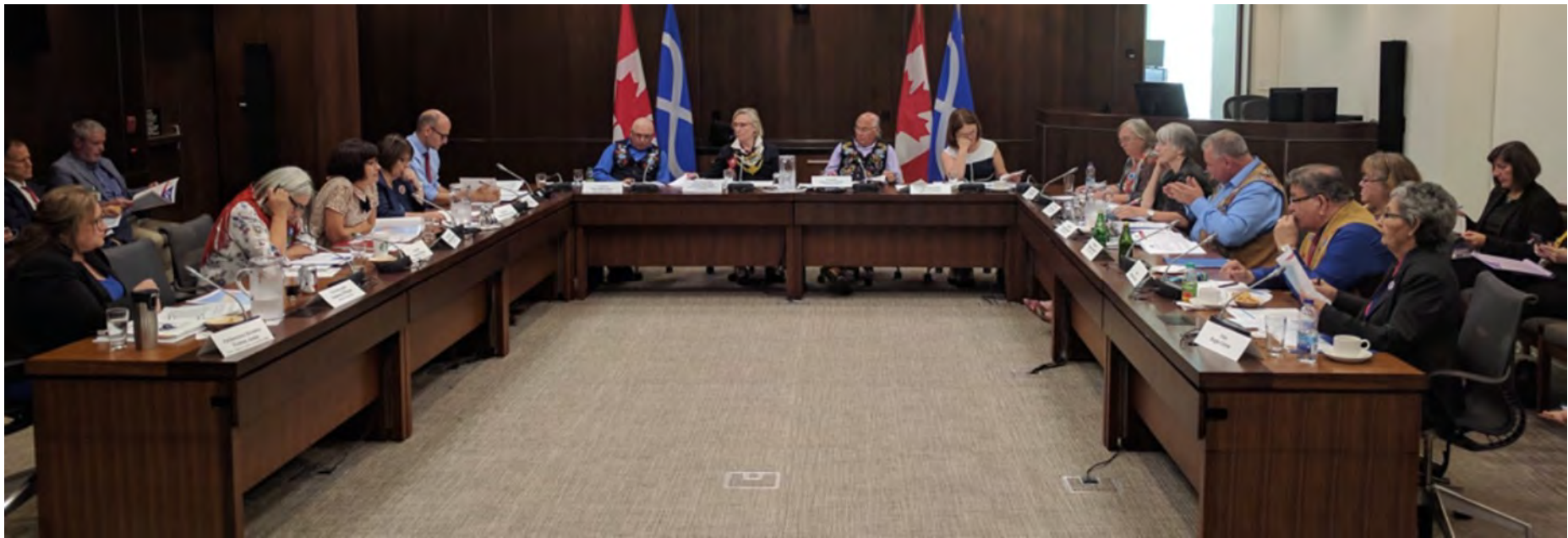
Metis Nation leaders meeting and federal cabinet. Ottawa, Sept 21.2017