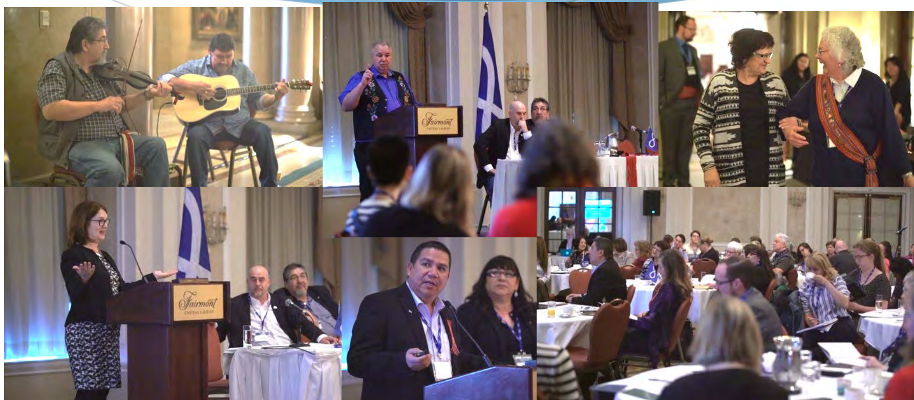
Métis Nation Health Forum, February 26–27, 2018, Ottawa, ON